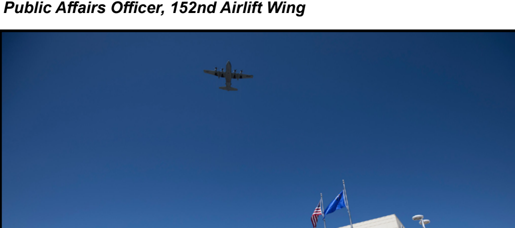
A 152nd Airlift Wing C-130 soars over Carson Tahoe Medical Center as part of the unit's Salute to Medical Professionals for its flyover of 13 hospitals in northern Nevada and California during the region's COVID-19 outbreak in April 2020.