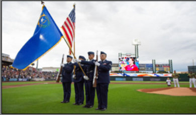
Color Guard Presentation performed at the Greater Nevada Field for the Reno Aces.

Presenting Colors for on-base events such as promotions, retirements, change of command, award ceremonies and etc.