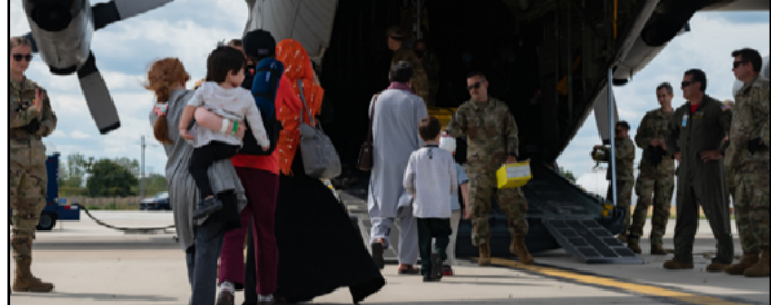
African families load onto a C-130H assigned to the 182nd Airlift Wing, Illinois Air National Guard, at the Philadelphia International Airport, Pennsylvania, September 11, 2021. These families were flown to Camp Atterbury, Indiana, as part of Operation Allies Welcome.