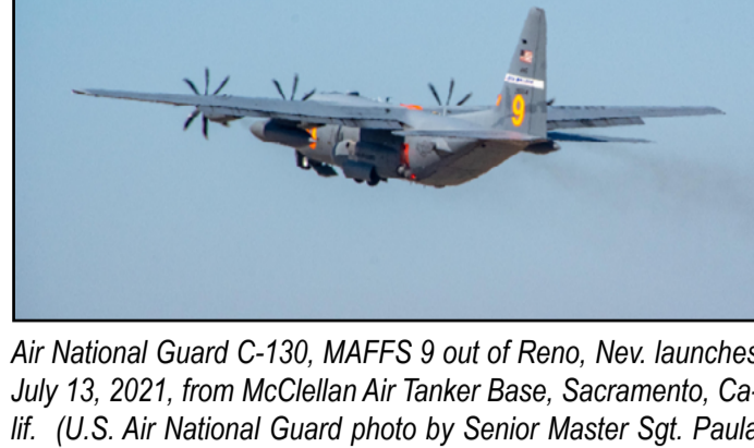
Air National Guard C-130, MAFFS 9 out of Reno, Nev. launches July 13, 2021, from McClellan Air Tanker Base, Sacramento, Calif.