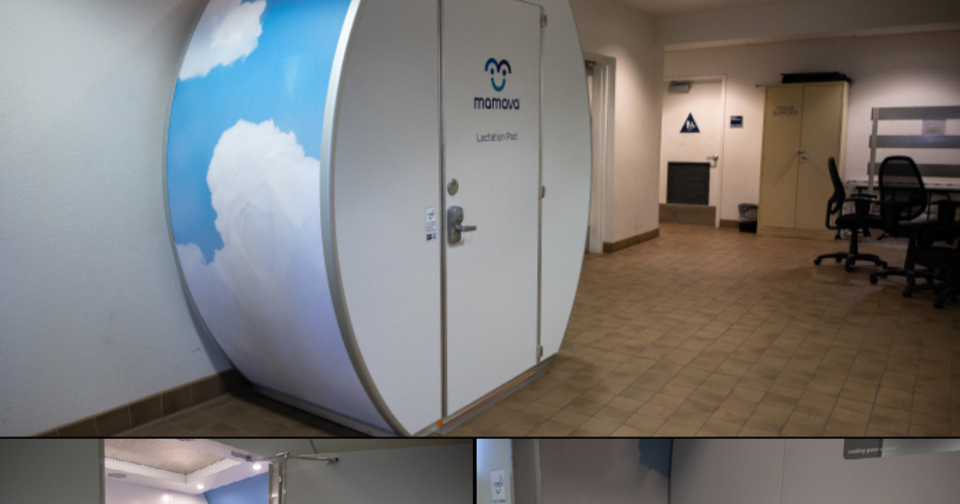
A Mamava lactation suite sits in the entryway of the maintenance building at the Nevada Air National Guard Base, Reno, Nev., October 13, 2021. The pod is the first of its kind in Reno and aims to provide a private, secure and safe place for nursing members and dependents to breastfeed or pump breastmilk.