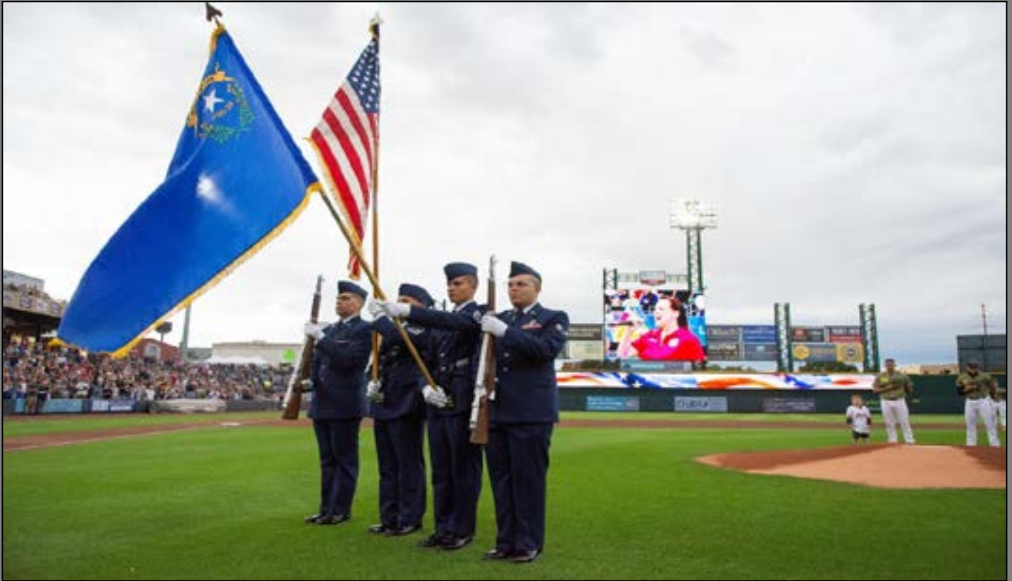
Color Guard Presentation performed at the Greater Nevada Field for the Reno Aces.

Presenting Colors for on-base events such as promotions, retirements, change of command, award ceremonies and etc.