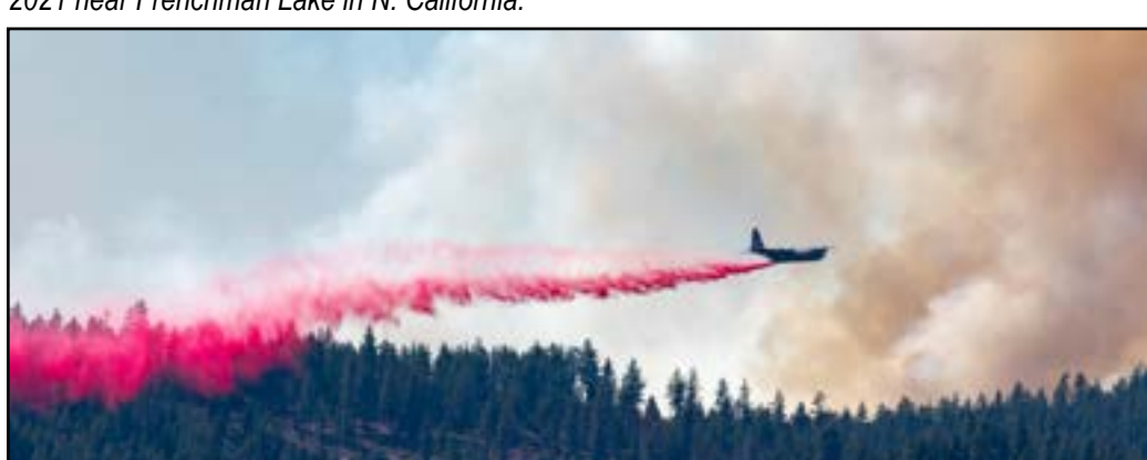
BELOW: MAFFS 9, out of Reno, Nev. drops retardant on the Beckwourth Complex Fire July 9, 2021 near Frenchman Lake in N. California.