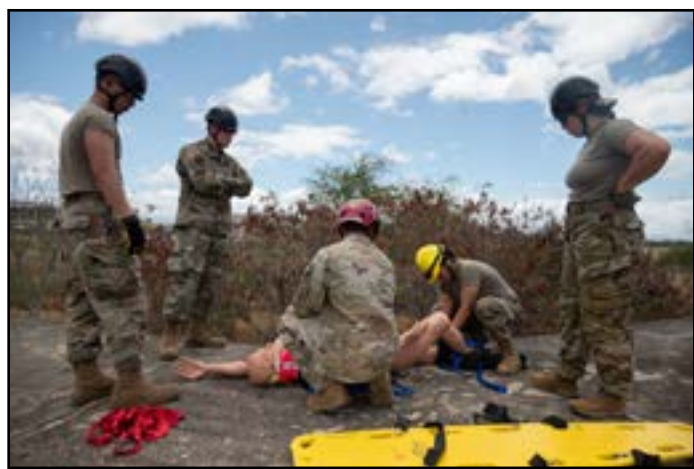
Members of the Nevada and Hawaii Air National Guard search and extraction teams load a mannequin onto a backboard during a joint hazard assessment exercise in Kapolei, Hawaii, June 17, 2021. The Airmen had extracted the mannequin from a hillside during a simulated hurricane response.