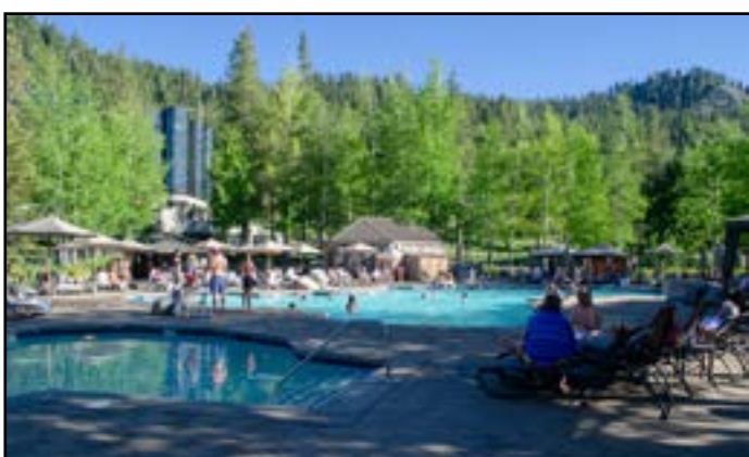
High Rollers and spouses attend Strong Bonds Marriage Retreat at the Resort at Squaw Creek from June 11-13, 2021. The venue offered a variety of activities to include: golfing, bike riding, hiking, and swimming or soaking in any of the several hot tubs.