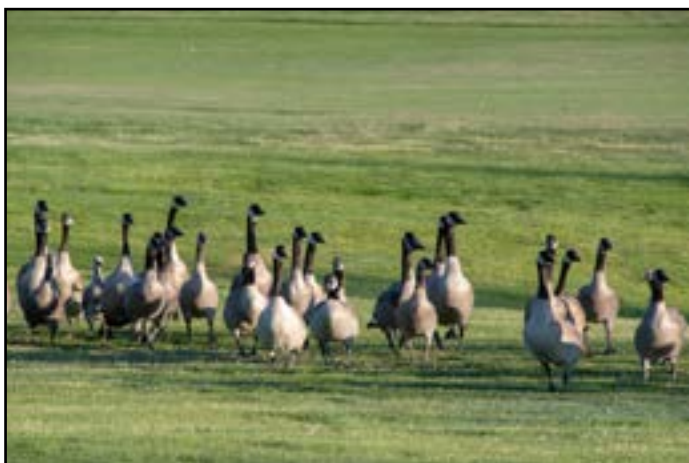
A flock of geese being gathered during this year's United States Department of Agriculture and the Nevada Department of Wildlife Canada Goose Round-Up at Lakeridge Golf Course, Reno, Nev.

By Senior Master Sgt. Paula Macomber 152nd Airlift Wing Public Affairs