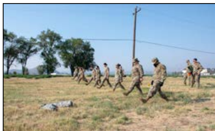
Airmen performing search and rescue of a simulated aircraft disaster area during the hands-on exercise portion of Home Station Readiness Training (HSRT) in Reno, Nev. Over 100 Airmen from around the country came to the HSRT hosted by the Nevada Air National Guard's Force Support Squadron July 26-30, 2021.