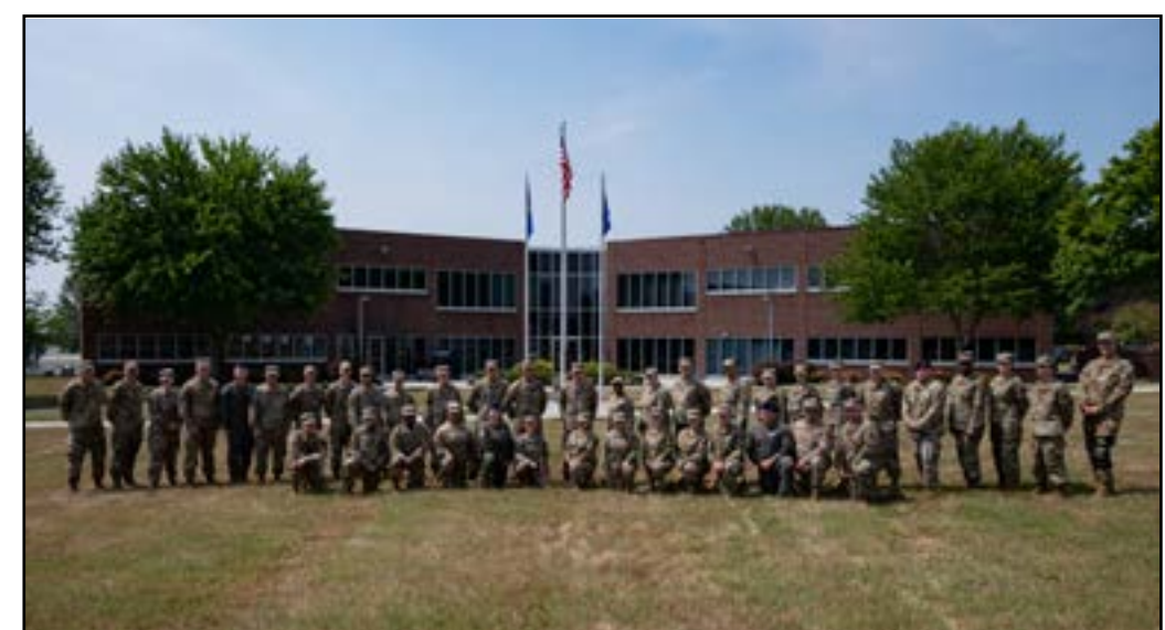
Airmen from the Nevada National Guard pose after completing the Battle Born Professional Development Fly-Away at McGhee-Tyson Air National Guard Base, Tenn., July 29, 2021. The Airmen represented various units from the 152nd Airlift Wing, 152nd Intelligence Squadron, 232nd Test and Evaluation Squadron, as well as leadership from the state headquarters.