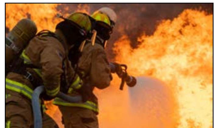
152nd Civil Engineer Squadron fire protection specialists extinguish an exterior fire of a C-130 aircraft frame during a live burn exercise at Volk Field Air National Guard Base, Wis., July 7, 2021. The firefighters are training in a live-burn exercise to practice firefighting techniques and procedures in a real-world environment.