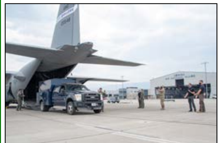
The 192nd Airlift Squadron, 92nd Civil Support Team and 152nd Air Terminal Function practiced some joint training July 30 at the Nevada Air National Guard Base.