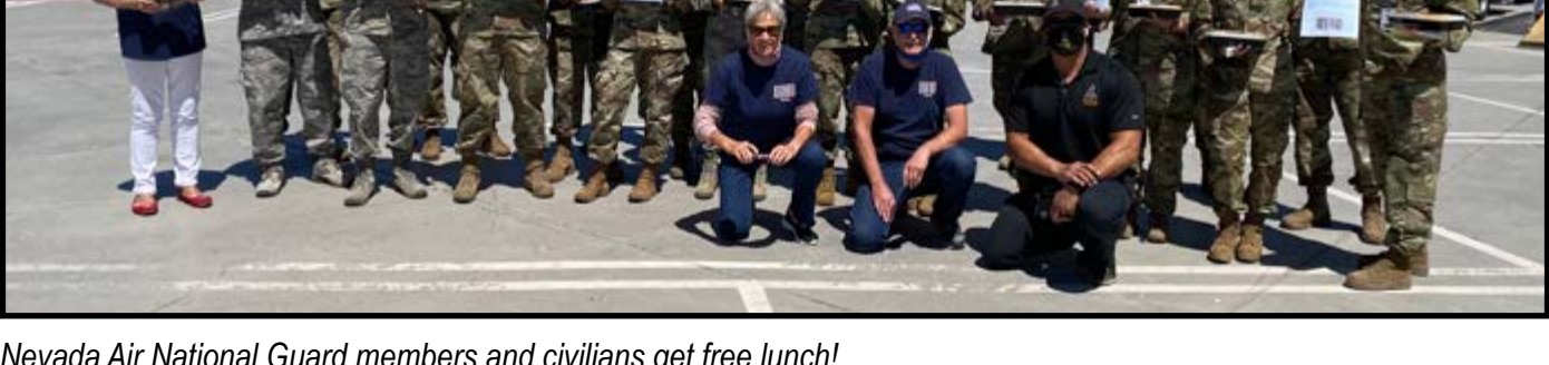
Nevada Air National Guard members and civilians get free lunch!