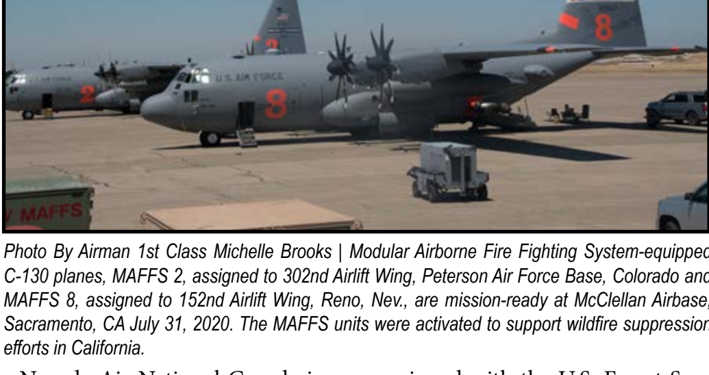
Modular Airborne Fire Fighting System-equipped C-130 planes, MAFFS 2, assigned to 302nd Airlift Wing, Peterson Air Force Base, Colorado and MAFFS 8, assigned to 152nd Airlift Wing, Reno, Nev., are mission-ready at McClellan Airbase, Sacramento, CA July 31, 2020. The MAFFS units were activated to support wildfire suppression efforts in California.